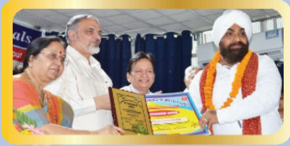
Received "Uttarakhand Ratan Award" From Governor

Vision: "To Serve Mankind through Education".